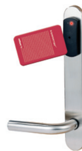
3. Close program mode