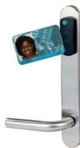
2. Program user card