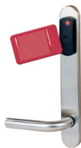
1. Open program mode

Requires three AAA LR03 1.5V batteries: estimated battery life over 20,000 operations.